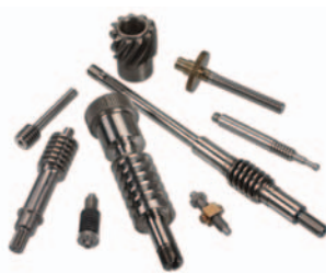
Worm and Helical Gears