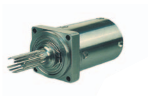
Custom Gear Box