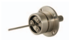
Custom Speed Reducer