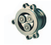
Custom Speed Reducer